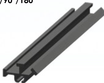
Fits Series 1432 (SS141)

Note: Consult a professional engineer when concerns of wave loads are involved.