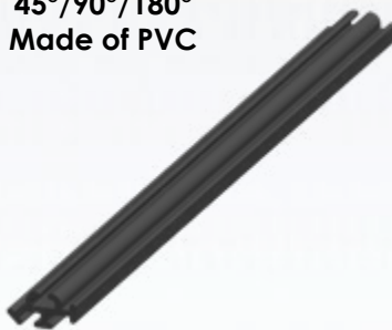
Fits Series 1580 (PVC001)