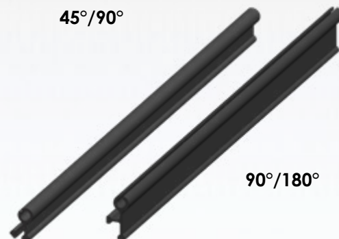
Fits Series 1560 (SS804 /SS809)