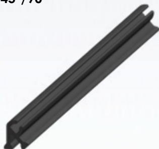
Fits Series 1610 (SS821)