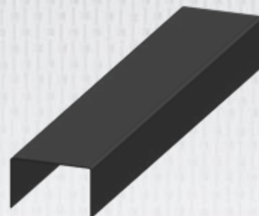
Fits Series 1560 (SS051)