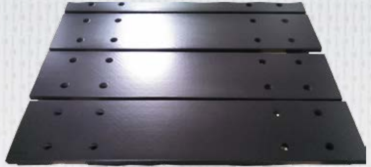
Splice Plate Close Up

The polyurethane matrix fiber reinforced pultruded wale splice plate has been designed to transfer 100% of the moment through thermoplastic and wood wale splices used extensively for bridge and asset fendering.