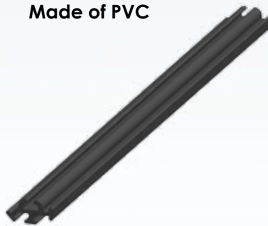
Series 1580 (PVC001)