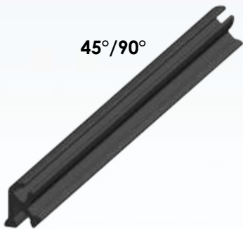
Series 1610 (SS821)