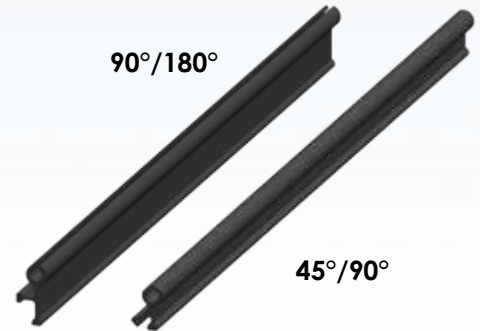
Series 1560 (SS804)