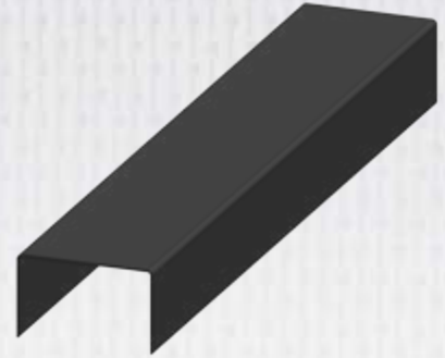
Series 1560 (SS051)