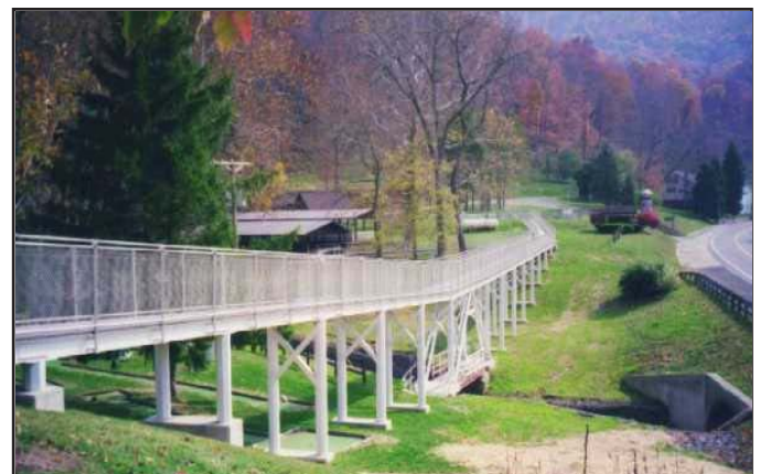
Pultruded Component Handicap Ramp Beacon Lodge