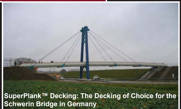
SuperPlank™ Decking: The Decking of Choice for the Schwerin Bridge in Germany